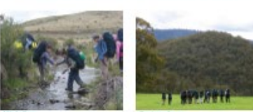
Year 9 camp members in winter gear standing in a snowy, mountainous landscape.

The outdoor education program at Radford is designed to provide students with a variety of outdoor experiences. These experiences are designed to challenge students and help them develop their leadership and teamwork skills.