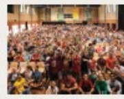
14. In February in the Hall 2010

Parade in February 2010. A photograph of a group of people holding a large rainbow flag.