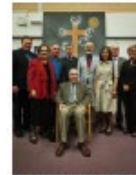
13. Boston 2010

In November 2010, the 20th anniversary of the 9/11 attacks, we had an event with deep connections to the past, present and future.