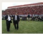
3. In Boston 2010

In Boston 2010. A photograph of a group of people performing on stage.