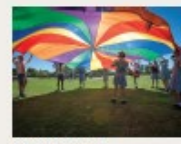
3. Parade in February 2010

Student Models 2010. A photograph of two women in white dresses standing together.