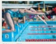
12. Boston 2010

Fairy Tree, Madison 2010. A photograph of a large tree trunk in a forest.