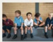
5. The Assembly 2010

Boston 2010. A photograph of a group of people at an event.