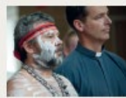
4. Boston 2010

Boston 2010. A photograph of a group of people at an event.