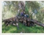
11. Fairy Tree, Madison 2010

A collection of photos and illustrations