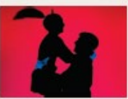
4. Boston 2010

Little Town 2010. A photograph of a group of people at an event.