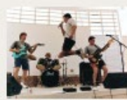
2. In Boston 2010

In Boston 2010. A photograph of a group of people at an event.