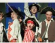
3. Little Town 2010

A collection of photos and illustrations