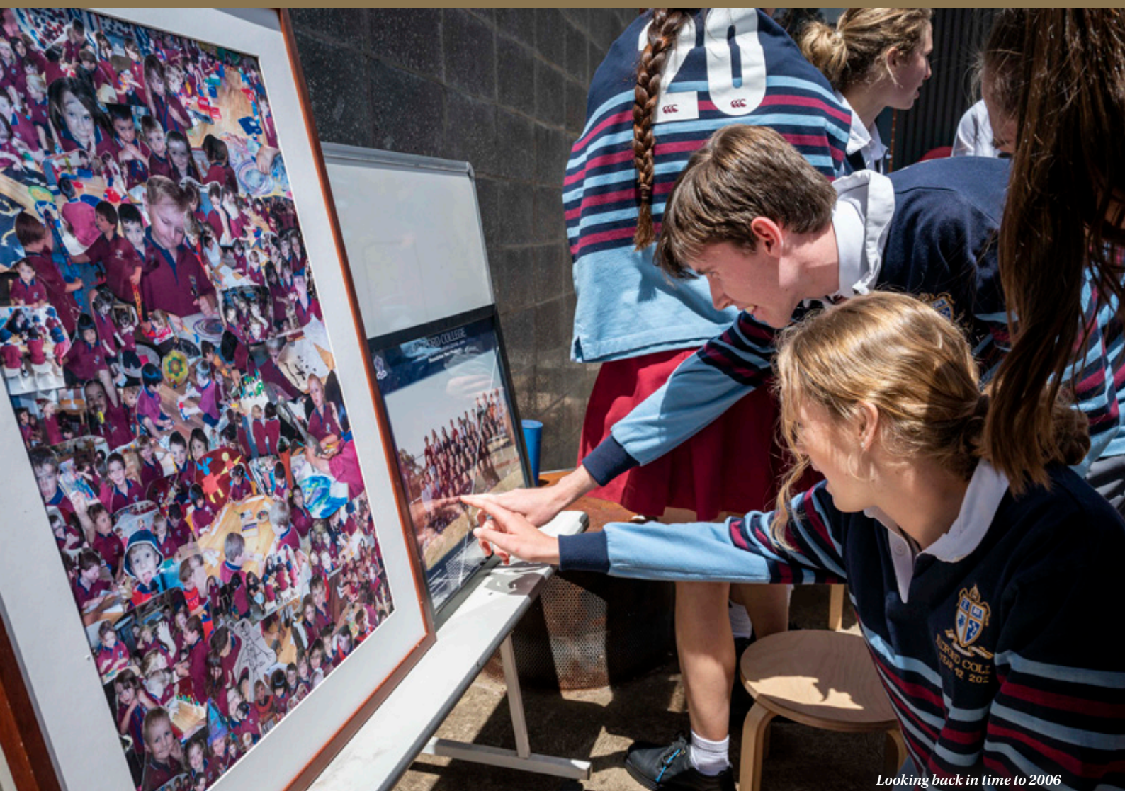
Looking back in time to 2006